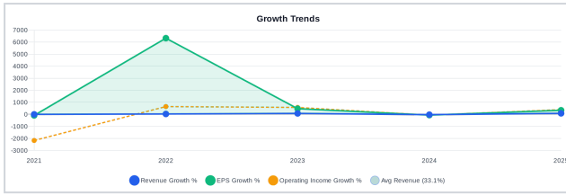
GROWTH TRENDS — REVENUE, EPS & OPERATING INCOME